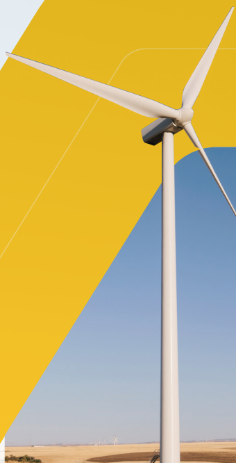
SOLAR & WIND FARMS

We have partnered with customers for nearly five decades, and we are committed to deeply-held Core Values to benefit our customers, employees and communities with a focus on safety and a vision for the future.