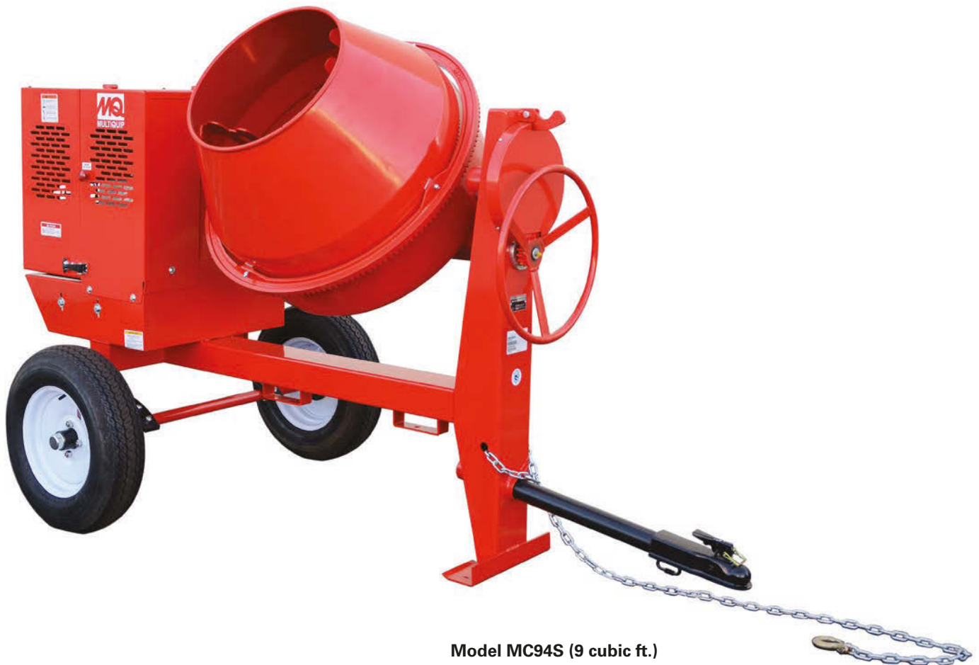
Model MC94S (9 cubic ft.)

Multiquip concrete mixers are available with either steel or polyethylene drums. Their durable construction and low maintenance requirements will provide you with years of reliable service.