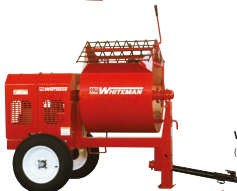
WM90S (9 cubic ft., Steel drum)