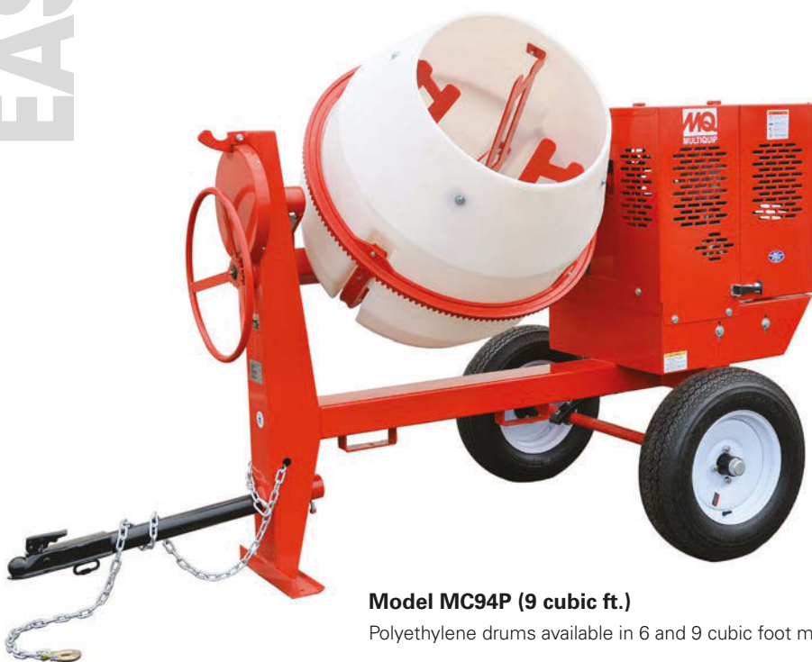
Model MC94P (9 cubic ft.)

The MC12PH concrete mixer handles your biggest and toughest applications. It features a 12 cubic ft. EasyClean™ drum and powerful Honda GX340 engine.