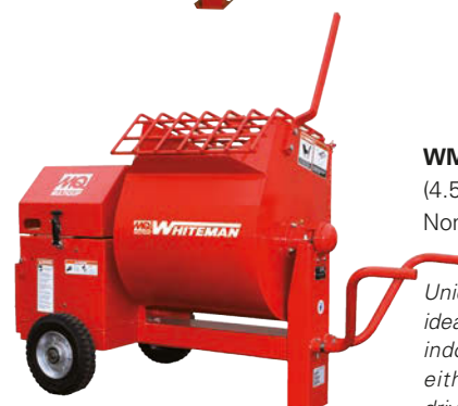
WM45 (4.5 cubic ft., Steel drum) Non-towable

Unique wheelbarrow design ideal for small batch jobs and indoor work. Available with either electric or gasoline drive.