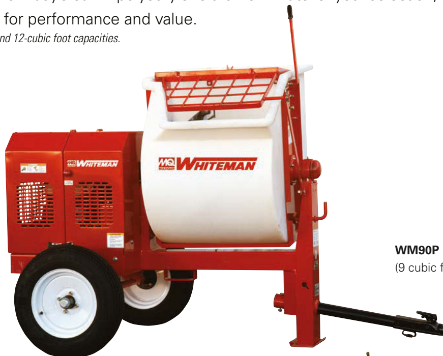
WM90P (9 cubic ft., Poly drum)

Models available in 7-, 9-, and 12-cubic foot capacities.