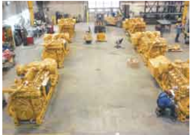
Oklahoma City Packaging Facility - Generator Staging Area