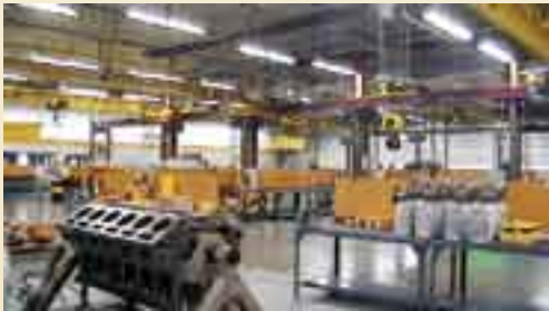
Tulsa Engine Rebuild Center

Warren CAT has the capability to respond quickly to your service needs backed by Cat's worldwide support network. Our team of engineers, electricians, and service technicians are ready to give you turnkey support. Complete system design, delivery, installation and operations. We take care of the equipment so you can focus on your business.