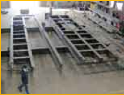
Oklahoma City Packaging Facility Master Skid Fabrication Area