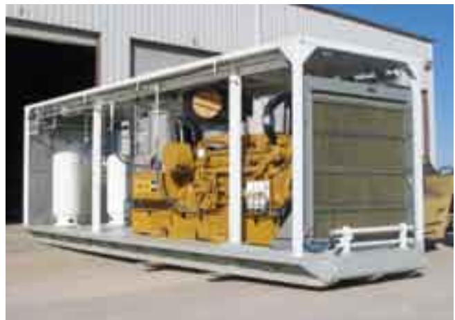
3516B Diesel generator set for an International SCR Land Drilling Rig from our Midland PSD location