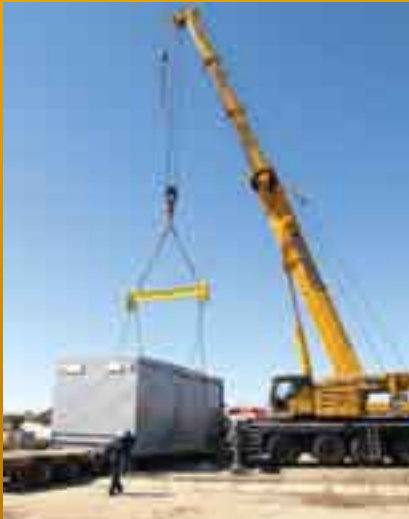
Load-Out of a 50-ton Emergency Offshore 1000 KW Generator Set