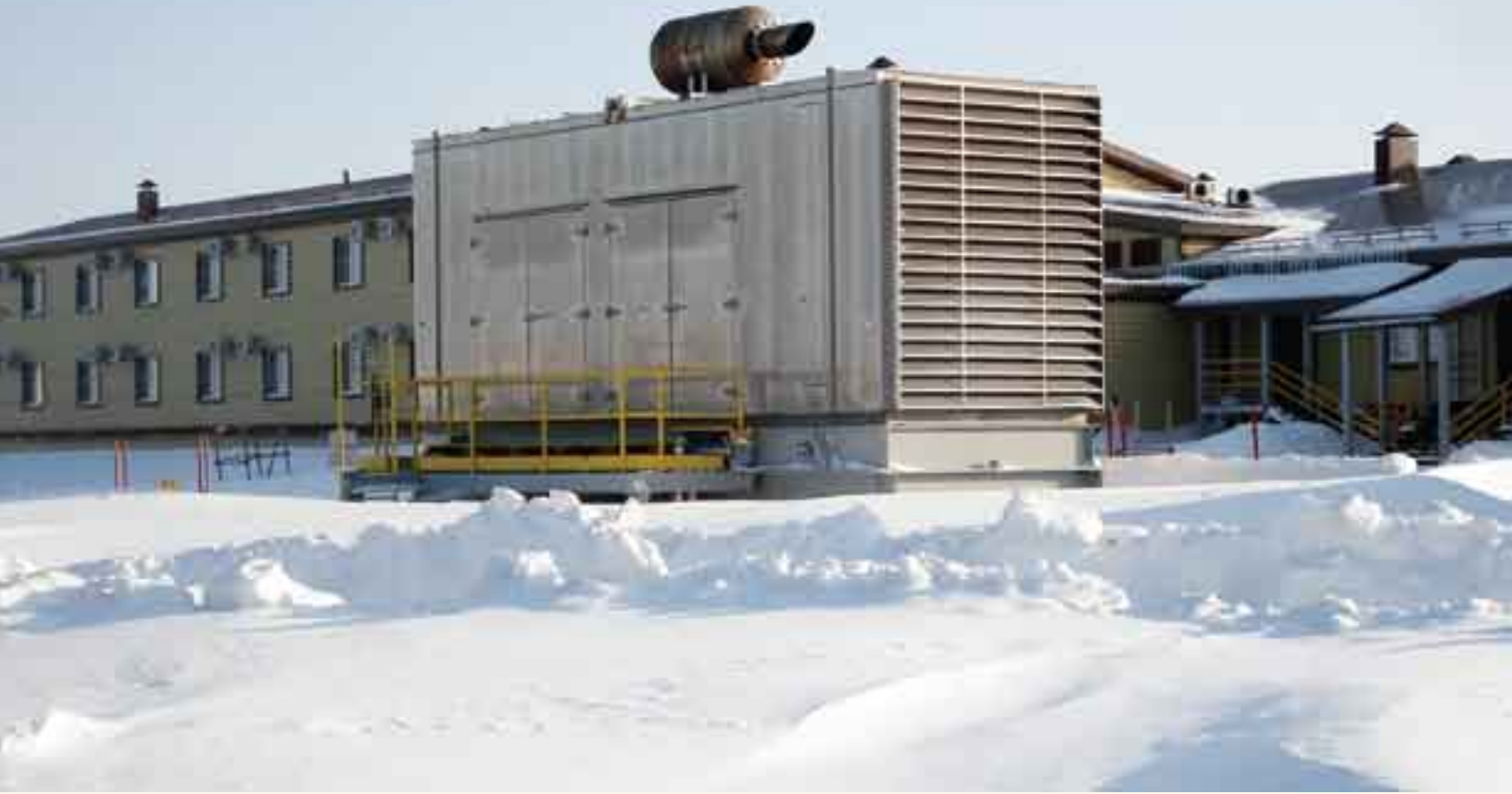
Arctic 3512B Diesel Generator Set - Eastern Russian Federation, fabricated out of Midland PSD