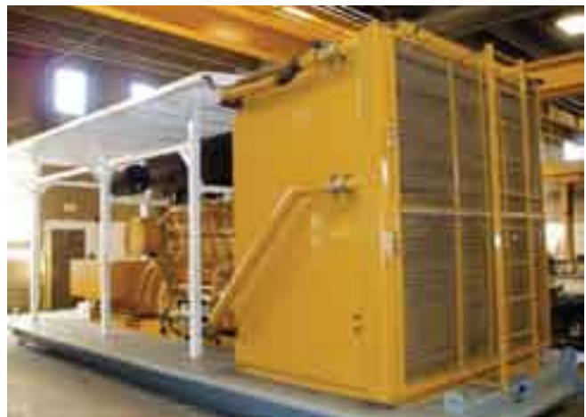
3512C Diesel Generator Set for a Domestic SCR Land Drilling Rig