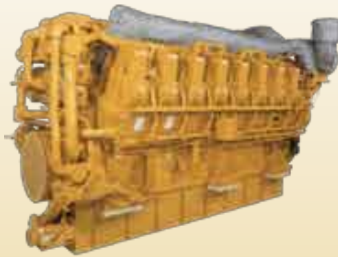
Gas 3616 Compression Engine