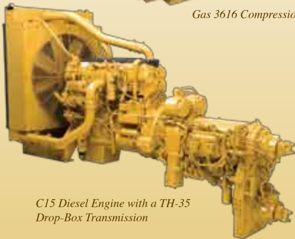
C15 Diesel Engine with a TH-35 Drop-Box Transmission