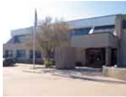
Oklahoma City Location