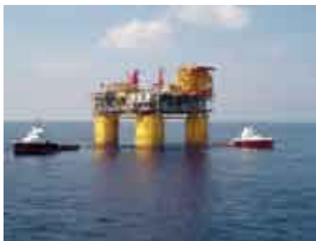
Magnolia Garden Banks Tension - Leg Platform